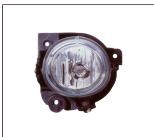
FOG LAMP 939.MZ2017 R:UR82-51-680 L:UR82-51-690