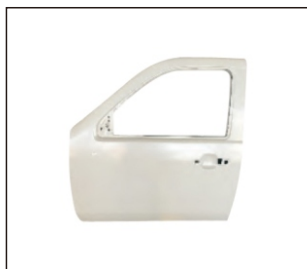
FRONT DOOR 907.MZ28010A R: