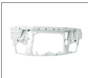
RADIATOR SUPPORT 904.MZ30109A OE: