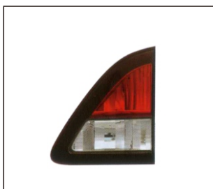
BACK LAMP (2015) 933.MZ7315 R: