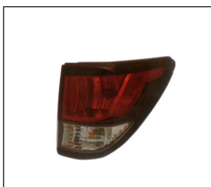
TAIL LAMP (2015) 931.MZ7012 R: