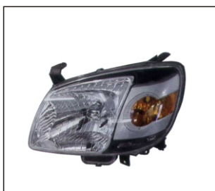
HEAD LAMP BLACK 930.MZC380 R: