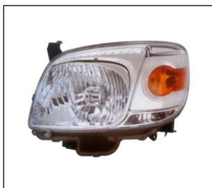
HEAD LAMP 930.MZC379 R: