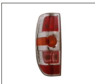
TAIL LAMP 931.MZ7011 R: