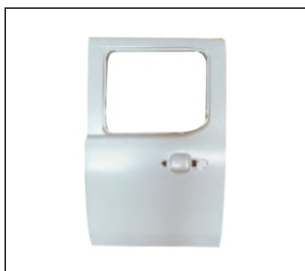
REAR DOOR 907.MZ28011A R: