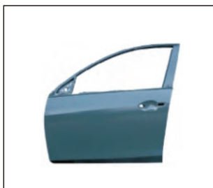
FRONT DOOR 907.MZ28002A R: