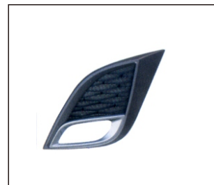
FOG LAMP COVER 913.MZ9381 R: L: