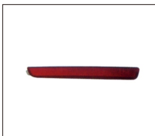
REAR BUMPER REFLECTOR 932.MZ7002 R