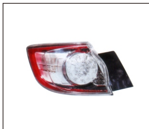
TAIL LAMP 5D 931.MZ7007 216-1981 R: