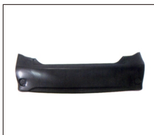
REAR BUMPER 901.MZ04911BA OE