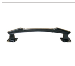
REAR BUMPER REINFORCEMENT 911.MZ70004A OE