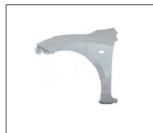
FRONT FENDER 905.MZ17002A R: