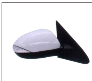
MIRROR ELECTRIC FOLDABLE W/LAMP 980MZ1230E R:BFF7-69-12Z L:BFF7-69-18Z