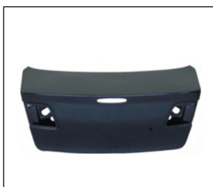
TRUNK LID 928.MZ90824A OE: