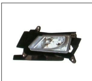
FOG LAMP 939.MZ7018 R