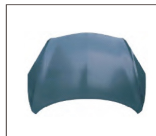
HOOD 902.MZ31003A OE