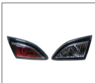
BACK LAMP 933.MZ7310 216-1311 R:BBM4513F0E L:BBP2513G0D