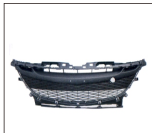
BUMPER GRILLE 901G.MZ04085BA OE