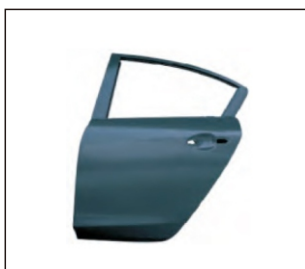
REAR DOOR 907.MZ28003A R: