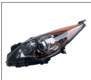
HEAD LAMP MANUAL 930.MZ9007 R