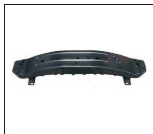
FRONT BUMPER REINFORCEMENT 911.MZ70002A OE: BBM450070B