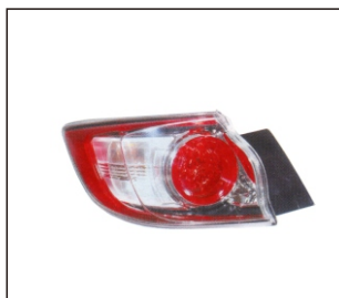
TAIL LAMP 5D 931.MZ7008 216-1982 R: