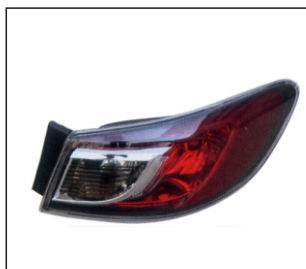
TAIL LAMP 931.MZ7004 R: BFF4-51150 L: BFF4-51160