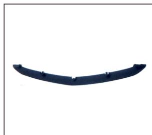
FRONT BUMPER APRON 903.MZ50419A R: L: