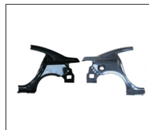
REAR FENDER 905.MZ17007A R:

All trademarks and vehicle models (including their names and pictures) mentioned in this catalogue are for reference only. Our production is not original replacement parts but interchangeable against original parts.