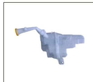
WINDSHIELD WASHER 509.MZ5003A OE