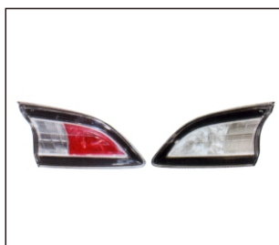
BACK LAMP 933.MZ7313 R: