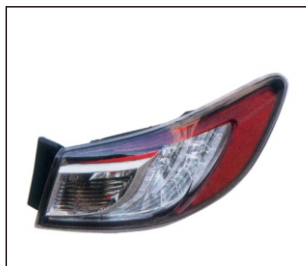
TAIL LAMP 931.MZ7005 R: BFF7-51150 L: BFF7-51160