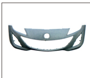
FRONT BUMPER 901.MZ04910BA OE