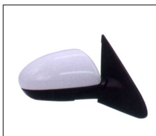
MIRROR ELECTRIC 980MZ129E R:BFF4-69-12Z L:BFF4-69-18Z