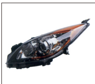
HEAD LAMP ELECTRIC W/MOTOR 930.MZ9007E R