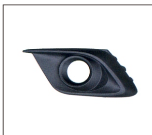
FOG LAMP COVER 913.MZ9382 OE: BKD1-50-C21