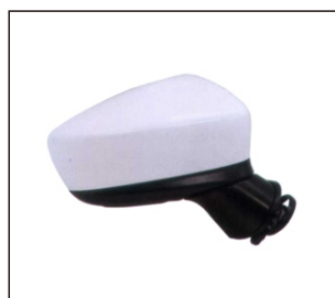
MIRROR ELECT, HEATED, FOLDABLE W/LAMP 980.MZ134E-2 R:BKC6-69-12Z L:BKC6-69-18Z