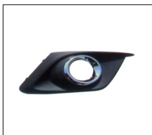
FOG LAMP COVER W/ CHROME 913.MZ9384 OE: BLE7-50-C11