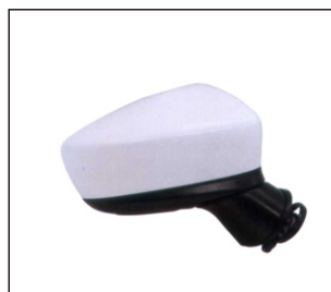
MIRROR ELECTRIC W/LAMP 980.MZ134E-1 R:BKC3-69-12Z L:BKC3-69-18Z