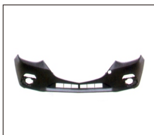
FRONT BUMPER 901.MZ04912BA OE: BKC3-50-031