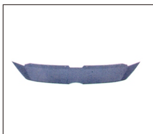
GRILLE 900.MZ08005GA OE: BKC3-50-033