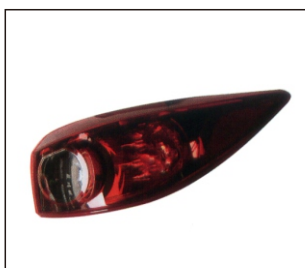
TAIL LAMP 931.MZ7006 OE: