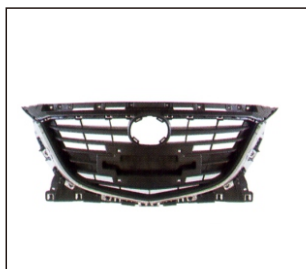
GRILLE 900.MZ08004GA OE