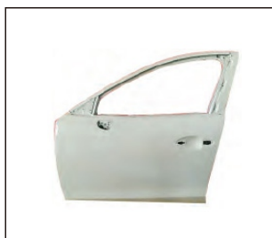
FRONT DOOR 907.MZ28004A R: