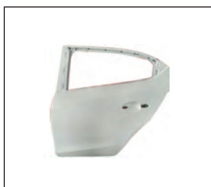
REAR DOOR 907.MZ28005A R: