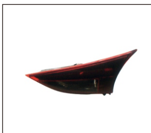
BACK LAMP 933.MZ7311 OE: