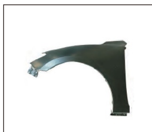
FRONT FENDER 905.MZ17010A R: