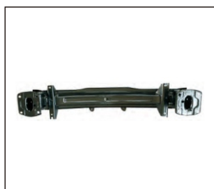
REAR BUMPER REINFORCEMENT 911.MZ27008A OE: