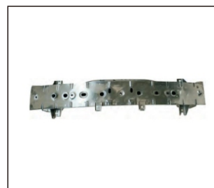
FRONT BUMPER REINFORCEMENT 911.MZ27007A OE:

All trademarks and vehicle models (including their names and pictures) mentioned in this catalogue are for reference only. Our production is not original replacement parts but interchangeable against original parts.