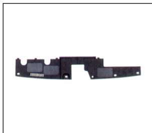
RADIATOR TANK BOARD 911.MZ44107A OE: BKC3-50-1A1