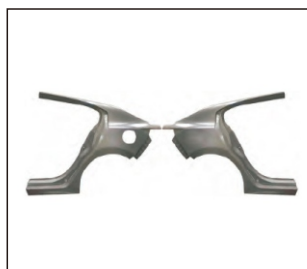
REAR FENDER 905.MZ17008A R: