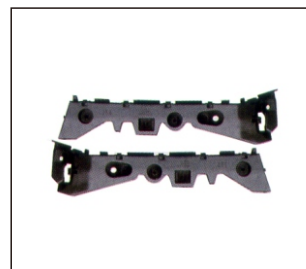
REAR BUMPER BRACKET 911.MZ44110 OE: BKC3-50-2J1