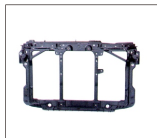
RADIATOR SUPPORT 904.MZ30108A OE: BKC3-53-110