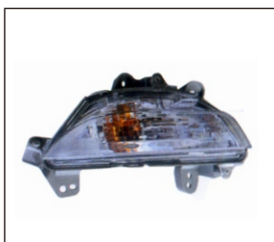
FRONT LAMP 932.MZ7004 R