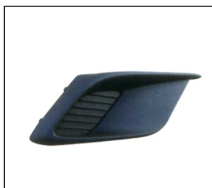
FOG LAMP COVER 913.MZ9383 OE: BKC3-50-C11