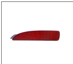
REAR BUMPER REFLECTOR 932.MZ7003 R