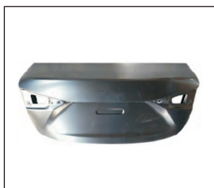
TRUNK LID 928.MZ90825A OE: