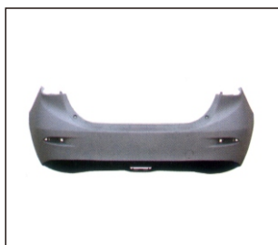
REAR BUMPER 901.MZ04913BA OE: BKC3-50-221