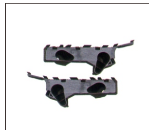
FRONT BUMPER BRACKET 911.MZ44109 OE: BKC3-50-0U1