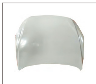
HOOD 902.MZ31004A OE: