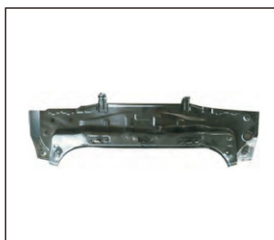
REAR PANEL 926.MZ32112A OE: