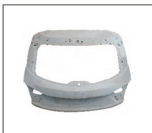
TRUNK LID 928.MZ90829A OE: