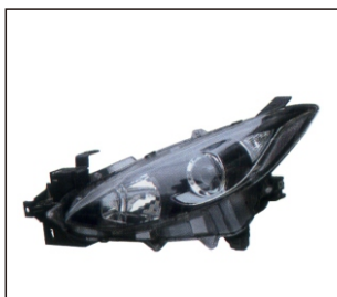
HEAD LAMP ELECTRIC W/MOTOR 930.MZ9008E R