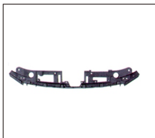
RADIATOR TANK BOARD 911.MZ44108A OE: BKC3-50-717